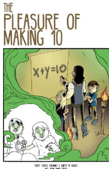
Meet Rene Descartes and learn about the linking of geometry and algebra. 34 pages. Gr. 6+