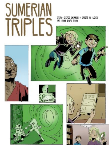
Meet the Sumerians, who invented what we today call the Pythagorean theorem. 25 pages. Gr. 6+